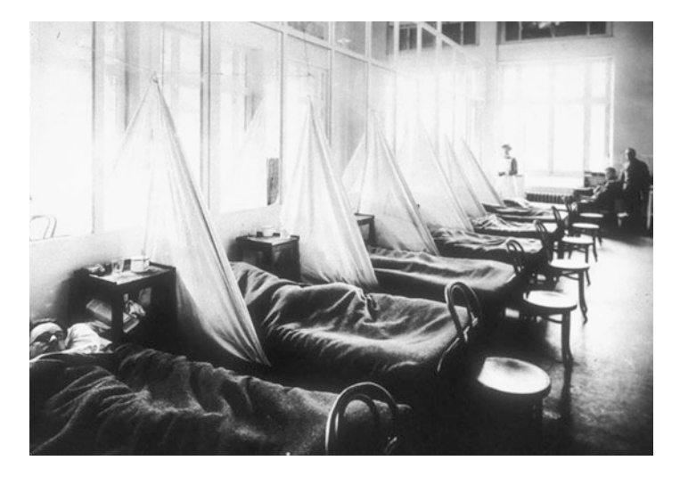
FIGURE 2.4 American Expeditionary Force, victims of Spanish flu in France, 1918. Uncredited U.S. Army photographer – U.S. Army Medical Corps photo via National Museum of Health & Medicine website at U.S. Army Camp Hospital No. 45, Aix-Les-Bains, France, Influenza Ward No. 1

This pandemic was also the first one where the longlingering effects could be observed and quantified. A study of US census data from 1960 to 1980 found that the children born to women exposed to the pandemic had more physical ailments and a lower lifetime income than those born a few months earlier or later. A 2006 study in the Journal of Political Economy found that "cohorts in utero during the pandemic displayed reduced educational attainment, increased rates of physical disability, lower income, lower socioeconomic status, and higher transfer payments compared with other birth cohorts" [50].