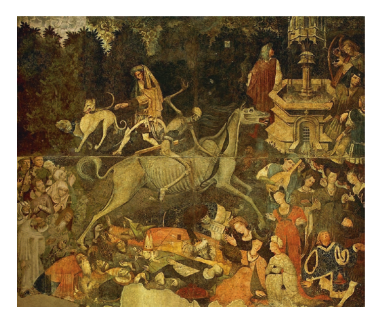
FIGURE 2.2 The Triumph of Death (Trionfo Della Morte), fresco, author unknown, cca. 1446, on display at Palazzo Abatellis, Palermo, Italy

lost their providers to plague or to fear thereof. In order to address this shortage in times of austere need, many municipalities contracted young doctors from whatever ranks were available to perform the duty of the plague doctor (medico della peste) [38]. Venice was among the first citystates to establish dedicated practitioners to deal with the issue of plague in 1348. Their principal task, besides taking care of people with the plague, was to record in public records the deaths due to the plague [39]. In certain European cities like Florence and Perugia, plague doctors were the only ones allowed to perform autopsies to help determine the cause of death and managed to learn a lot about human anatomy. Among the most notable plague doctors of their time were Nostradamus, Paracelsus, and Ambrois Pare [40]. The character of the plague doctor was